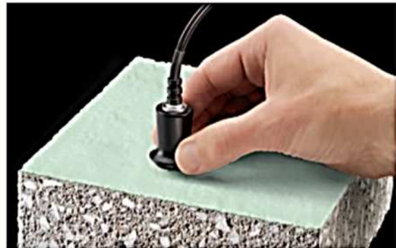
Measure thick protective coatings on concrete flooring, pipes, containment structures and more.