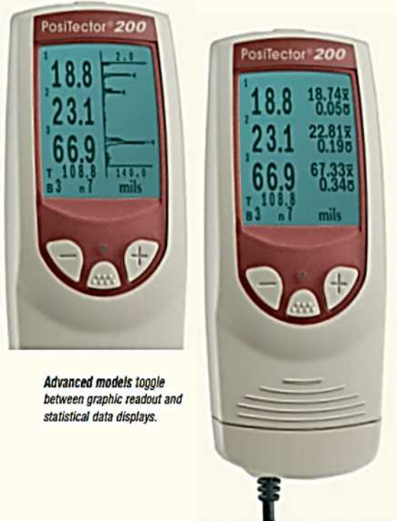
Advanced models toggle between graphic readout and statistical data displays.