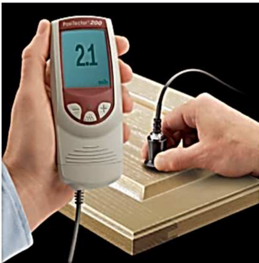
Standard model measuring total coating thickness on wood

Easy-to-read graphic format provides clear, detailed analysis of coatings