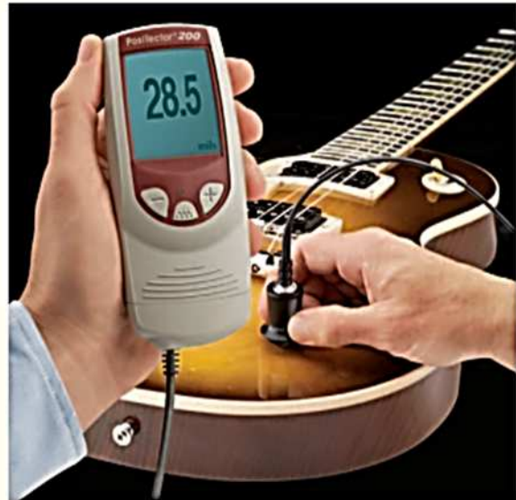
Measure paint, varnish, lacquer, etc. on wood products including cabinetry, furniture, flooring, windows and more.

Easily measure single or multiple layer coating thickness on a variety of substrates.